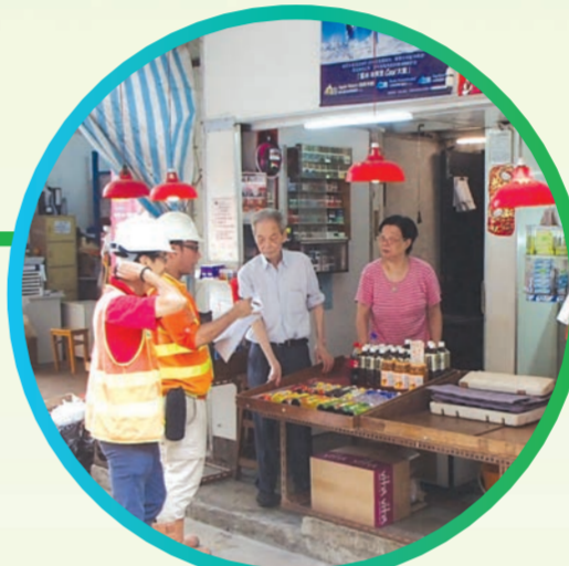
定期主動探訪區內商戶，匯報工程進度 Regular visits are conducted to nearby shops to report to shopkeepers the latest works progress and collect their views