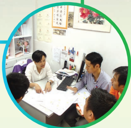
定期與黃大仙區議員和市民會面，解釋工程範圍 Regular meetings are held with Wong Tai Sin District Council members and public to explain the scope of works

此外，由於施工位置貼近民居、學校、商業樓宇和工業大廈，故在前期和施工期間，與各方保持緊密協調及溝通，屬工程團隊的重要工作之一。工程人員需要主動與區議員、鄰近商舖、工業和住宅大廈的管業處，以及市民進行定期會面和溝通，向他們詳細解釋工程範圍和各項細節，細心聆聽各持份者的意見，並適時匯報施工進度及時間表，以增進各方的相互了解，從而減少工程期間帶來的不便。