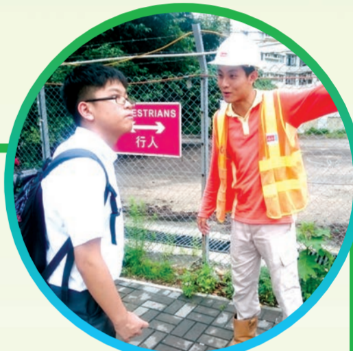
安排交通愛心大使協助途經工地附近的行人 Ambassadors are deployed near the construction sites to offer assistance