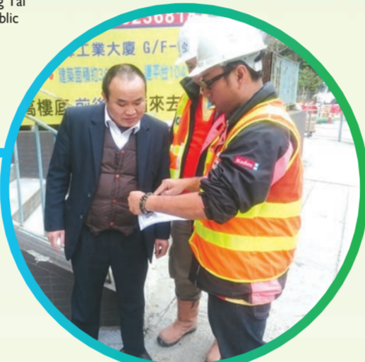
與附近的大廈管業處緊密溝通，解釋工程進度 Close communication on works progress is maintained with the building management offices in the neighbourhood

第二十一屆申訴專員嘉許獎頒獎典禮已於本年10月11日圓滿結束。此獎勵計劃自1997年設立，並由1999年起增設個人獎項，以表揚在處理公眾查詢和投訴方面有出色表現的公職人員。